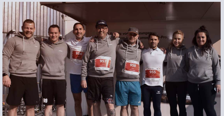
B2B run in Zug