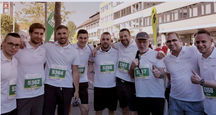
Company run Homburg

The verope® Service Center team at the „Firmenlauf Homburg“ with around 4000 participants of various companies of the region.